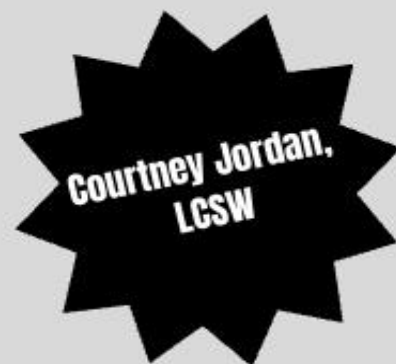
Contracted Licensed Clinical Social Worker